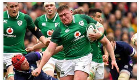
Ireland v Scotland

20 September Arrive at Narita or Haneda Airport, Tokyo 21 September Day at leisure in Tokyo 22 September Ireland v Scotland in International Stadium Yokohama 23 September Day at leisure in Tokyo 24 September Tokyo Sightseeing incl. Nakamise Shopping St 25 September Kamakura Sightseeing incl. Tatsumi Shrine 26 September Social event with local Tokyo rugby supporters 27 September Odawara sightseeing incl. Mount Fuji 28 September Ireland v Japan in Shizuoka Stadium Ecopa 29 September Day at leisure in Odawara 30 September Kyoto Sightseeing incl. Golden Pavilion 1 October Day at leisure in Kyoto 2 October Osaka Sightseeing incl. Dotonbori Street 3 October Ireland v Europe 1 in Kobe Misaki Stadium 4 October Day at leisure in Kobe 5 October Transfer to Osaka Airport for your evening flight back home