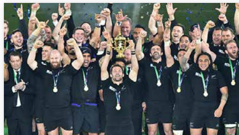
Champions of Rugby World Cup 2015

We only do rugby! We organise great rugby tours for supporters and teams and that is why we have been appointed as an Authorised Sub-Agent for Rugby World Cup 2019™, Japan. Our previous official appointments have included Rugby World Cup 2011 and 2015 and The British & Irish Lions Tours 2013 and 2017.