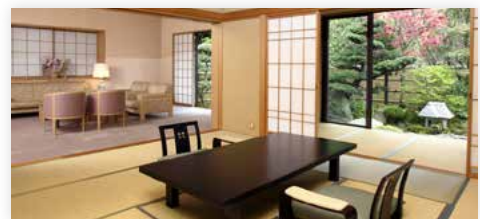
Traditional Japanese Ryokan

We only do rugby! We organise great rugby tours for supporters and teams and that is why we have been appointed as an Authorised Sub-Agent for Rugby World Cup 2019™, Japan. Our previous official appointments have included Rugby World Cup 2011 and 2015 and The British & Irish Lions Tours 2013 and 2017.