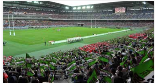
International Stadium Yokohama