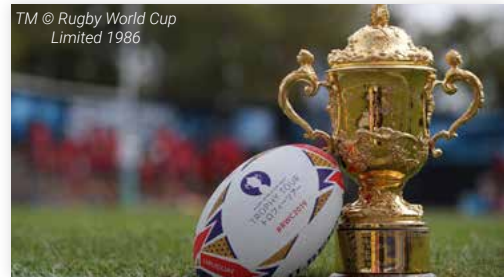
The Webb Ellis Cup