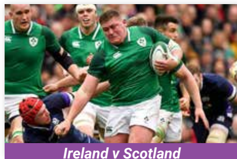
Ireland v Scotland