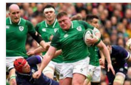
Ireland v Scotland