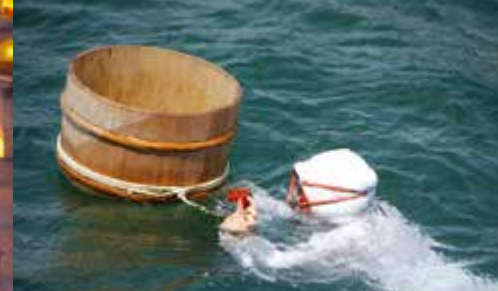
Pearl Island Diver