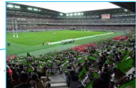
International Stadium Yokohama Kanagawa Prefecture, Yokohama City 横浜国際総合競技場 神奈川県・横浜市