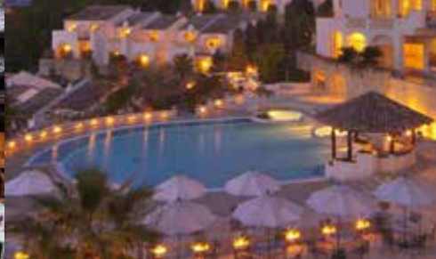
Prime Resort, Kashikojima