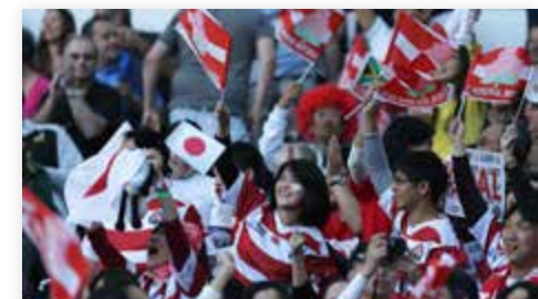
Japan Rugby Supporters