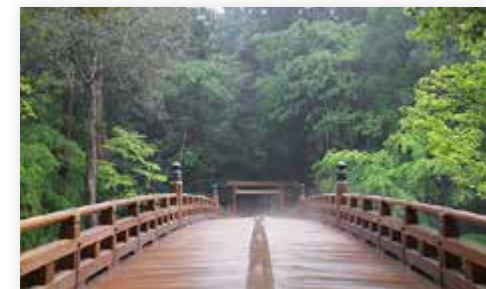
Inner Shrine Ise Shima