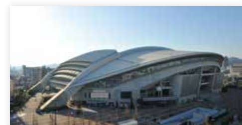
Kobe Misaki Stadium

What an incredible tour! Thank you so much for travelling with us and we hope to see you on another tour in the near future.