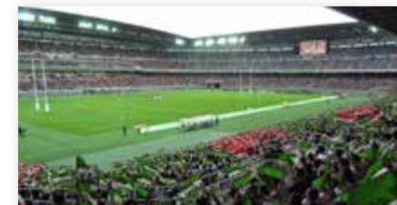
Yokohama International Stadium