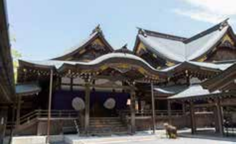
Ise Jingu Shrine