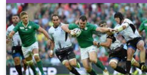
Ireland v Russia