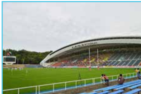
Fukuoka Hakatanomori Stadium Fukuoka Prefecture, Fukuoka City 東平尾公園博多の森球技場 福岡県・福岡市