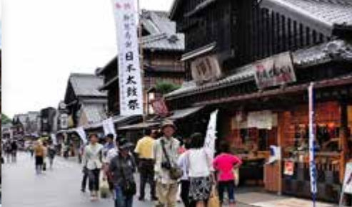
Oharai Machi Street