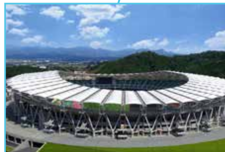
Shizuoka Stadium Ecopa Shizuoka Prefecture 小笠山総合運動公園エコパスタジアム 静岡県