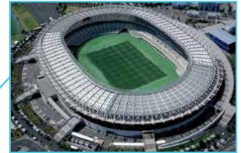
Tokyo Stadium Tokyo Metropolitan 東京スタジアム 東京都