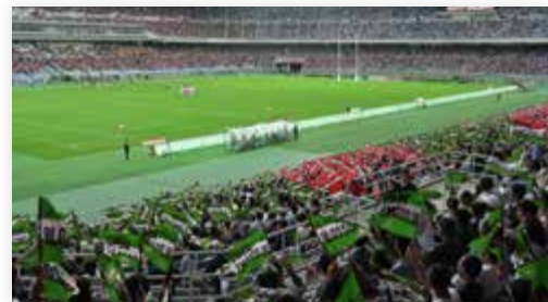
International Stadium Yokohama