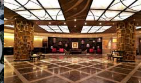
Crowne Plaza Grand Court