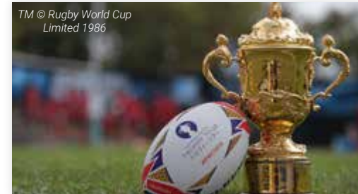
The Webb Ellis Cup