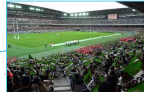
International Stadium Yokohama Kanagawa Prefecture, Yokohama City 横浜国際総合競技場 神奈川県・横浜市