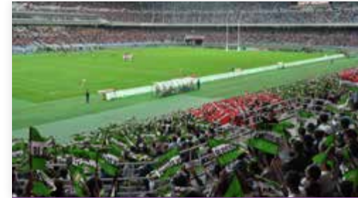
International Stadium Yokohama

Transfer to Narita or Haneda Airport for your flight back home