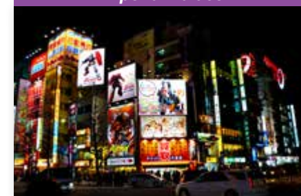
Akihabara Electric Town