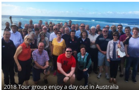
2018 Tour group enjoy a day out in Australia