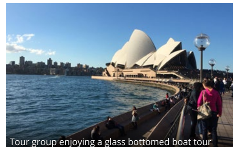
Tour group enjoying a glass bottomed boat tour