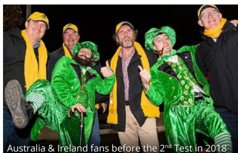
Australia & Ireland fans before the 2 nd Test in 2018

Check out of your hotel and executive coach transfer to Sydney Airport for your flight to Adelaide. Check in for a three night stay in the 5* Hilton Hotel in central Adelaide.