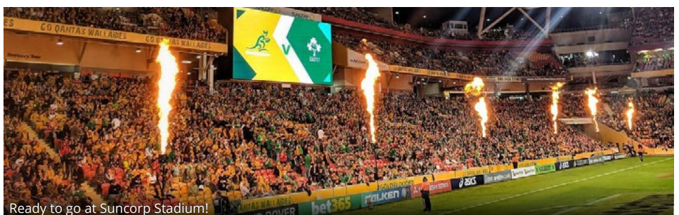
Ready to go at Suncorp Stadium!