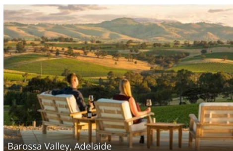
Barossa Valley, Adelaide