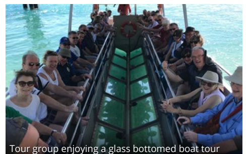
Tour group enjoying a glass bottomed boat tour