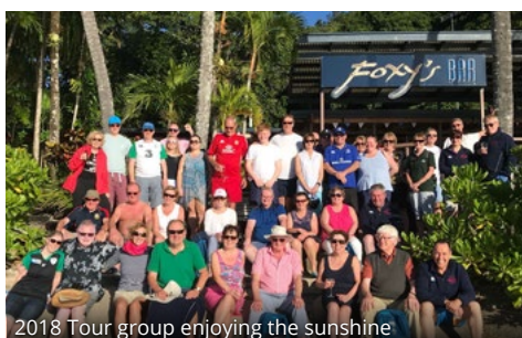
2018 Tour group enjoying the sunshine