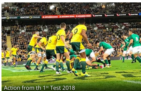
Action from the 1st Test 2018