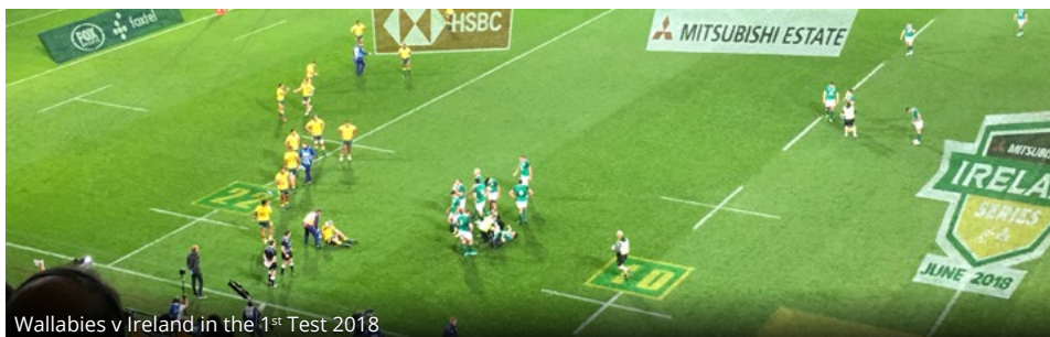
Wallabies v Ireland in the 1st Test 2018