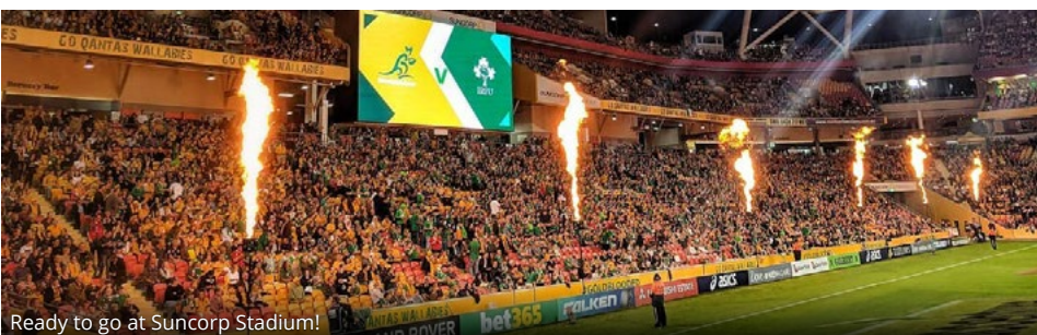
Ready to go at Suncorp Stadium!