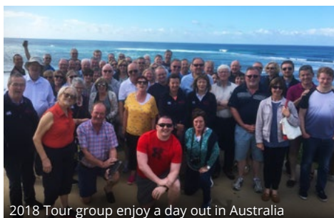
2018 Tour group enjoy a day out in Australia