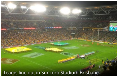
Teams line out in Suncorp Stadium Brisbane