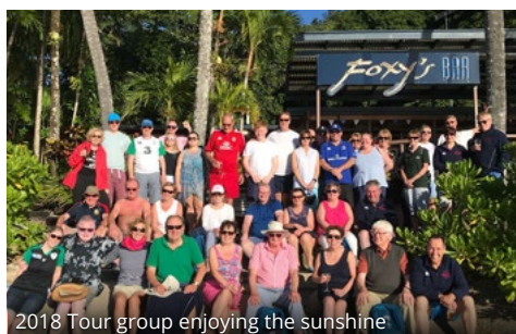
2018 Tour group enjoying the sunshine

Take in the wonderful sights that can only be viewed from the Swan River as you cruise the calm waters between Fremantle and Perth. Once you arrive in Fremantle this extended return cruise allows you the opportunity to hop off and explore at your own leisure.