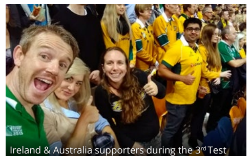
Ireland & Australia supporters during the 3rd Test