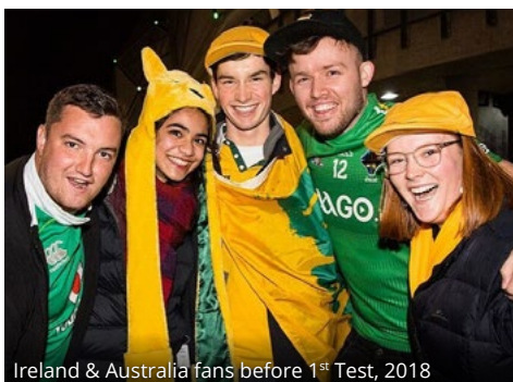
Ireland & Australia fans before 1 st Test, 2018