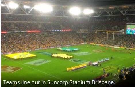
Teams line out in Suncorp Stadium Brisbane