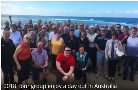
2018 Tour group enjoy a day out in Australia