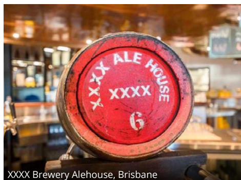
XXXX Brewery Alehouse, Brisbane