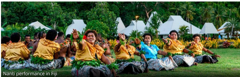
Nanti performance in Fiji