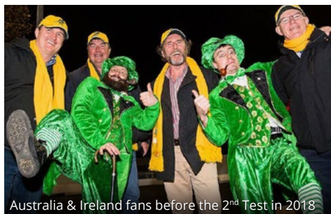
Australia & Ireland fans before the 2 nd Test in 2018

Match Day! Australia v Ireland at Sydney Cricket Ground. We will meet at a local restaurant that we have booked that is just a five minute walk from the hotel. Enjoy a three course meal with a complimentary two hour drinks package. You will then depart by executive coach to the iconic Sydney Cricket Ground where Ireland last played in 1979. Post-match transfer to the hotel bar for an end of series celebration!