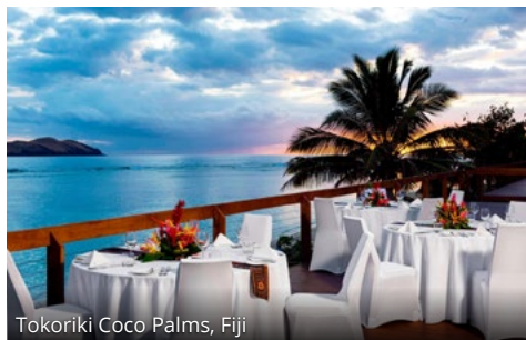
Tokoriki Coco Palms, Fiji

Land in Dublin after an incredible tour to Australia & Fiji. Thank you for travelling with Rugby Travel Ireland and we hope to see you on another tour again in the near future.