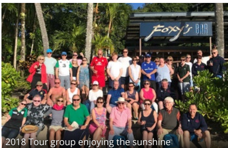
2018 Tour group enjoying the sunshine