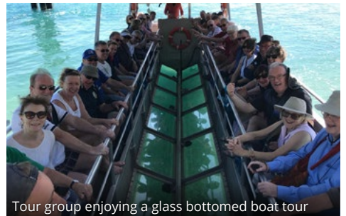
Tour group enjoying a glass bottomed boat tour