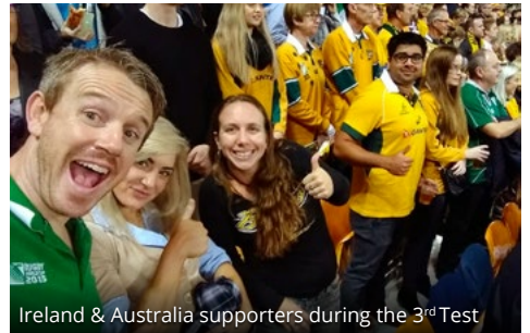
Ireland & Australia supporters during the 3 rd Test