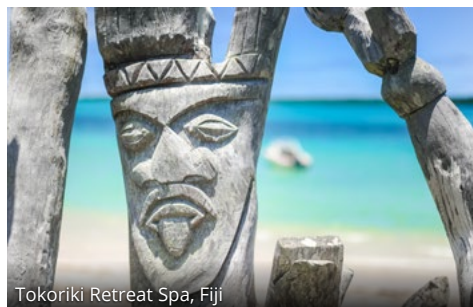
Tokoriki Retreat Spa, Fiji