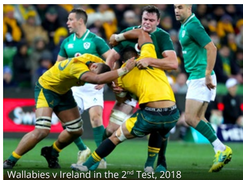
Wallabies v Ireland in the 2 nd Test, 2018

Day at leisure in Brisbane to relax after yesterday's match day exertions. We recommend a trip up Kangaroo Point Cliffs (for great views) or a tour of Queensland's famous XXXX Brewery!