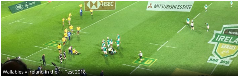
Wallabies v Ireland in the 1st Test 2018